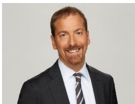
Chuck Todd Host of Meet the Press and MTP Daily